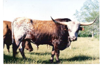
LITTLE ACE MRS DELICIOUS